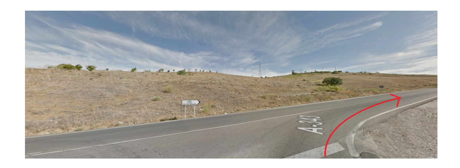
Continuing for approx. 500 m we'll reach the "T" intersection and turn right onto A-343 following direction Pizarra on the same A-343 for approx.44.00Km.