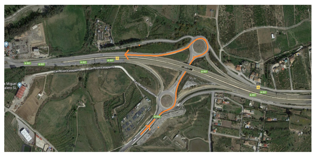
After approx. 8Km we'll take the exit from A-357 to arrive at the semi-roundabout

We will meet on February 23, starting 10.00AM again at Caffe MANUKA,in Shopping Center La Cañada, Marbella. After all the formalities, funds collectionS, we will leave at 10.45AM direction Monda on A-355 . We will continue an that road for approx. 30 KM till arriving at the road exchange roundabouts direction A-357 , Campillos.